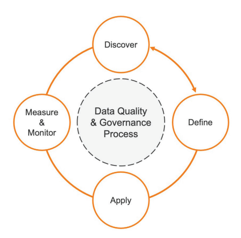
Figure 2: Informatica's Data Quality Management Process provides a comprehensive, holistic approach to dealing with data quality issues, helping organizations continuously improve data quality on-premises, in the cloud, and in a combination of both environments.

Regardless of the size or location of your university or the volumes and types of data that you work with, you can manage the entire data quality process with Informatica Data Quality. Whether your project is centered on working with student or third-party data, product or supplier data, finance data, or data from IoT devices, Informatica Data Quality will ensure that you can trust the quality of your data.